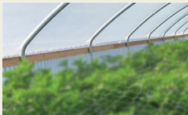
Rapid veg growth without a cal-mag or any nitrogen supplements. @hydroacific, California