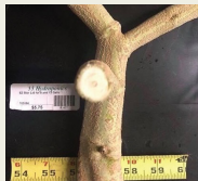
Thick af. No cal-mag. @55hydro, California