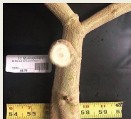
Thick af. No cal-mag. @55hydro, California